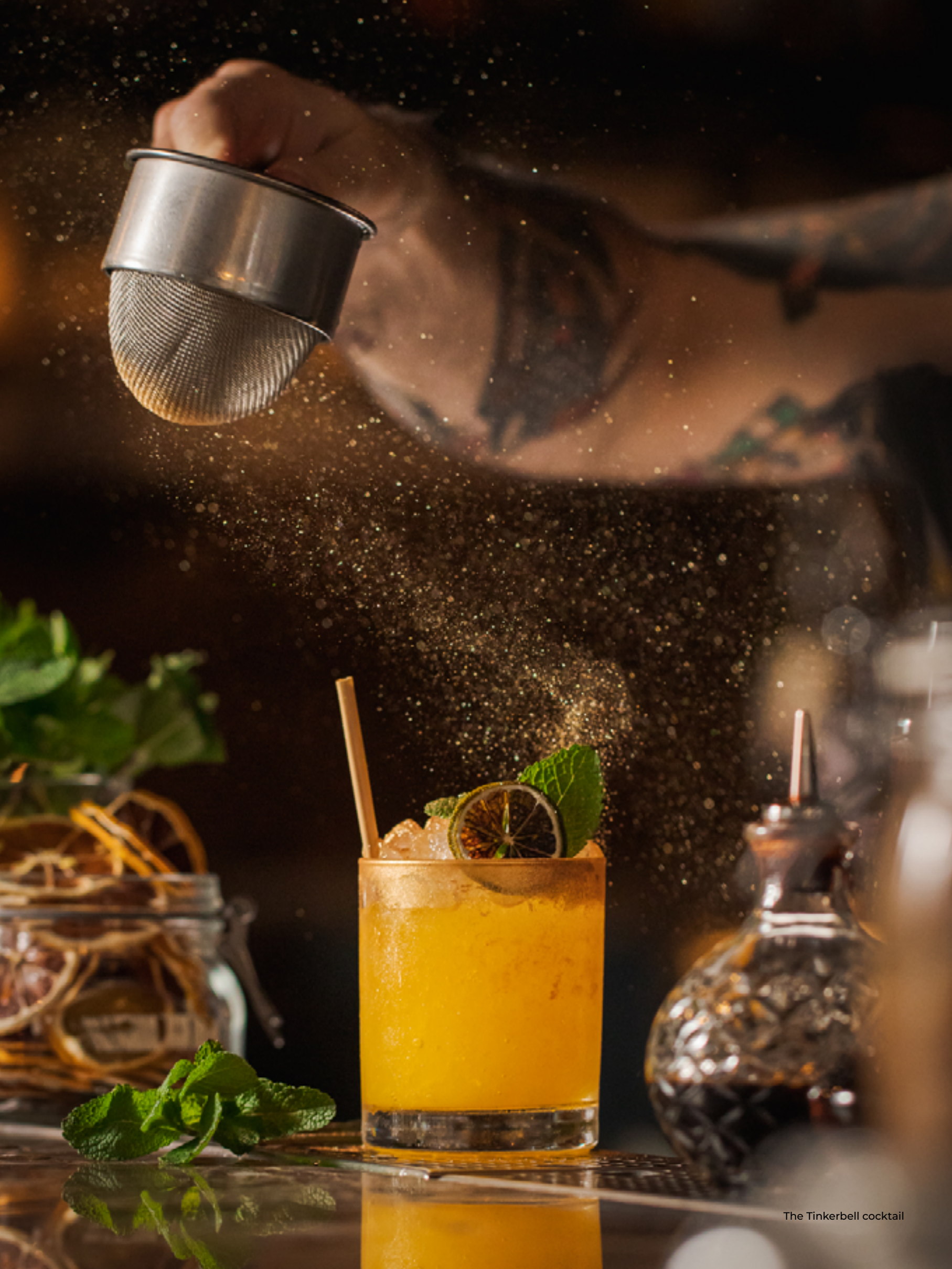
The Tinkerbell cocktail